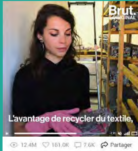
Video Brut: FabBRICK , exhibitor 2020