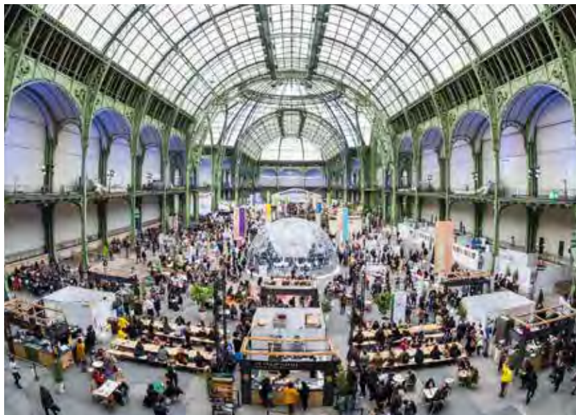
ChangeNOW Summit 2020 - Grand Palais, Paris

In one of the most emblematic venues on earth in front of the Eiffel Tower.